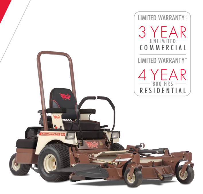
Standard PowerFold® Electric Deck Lift. See Page 13 for more info.