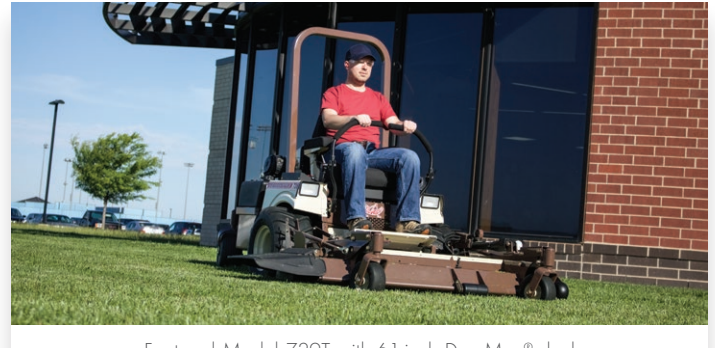
Featured Model 729T with 61-inch DuraMax® deck