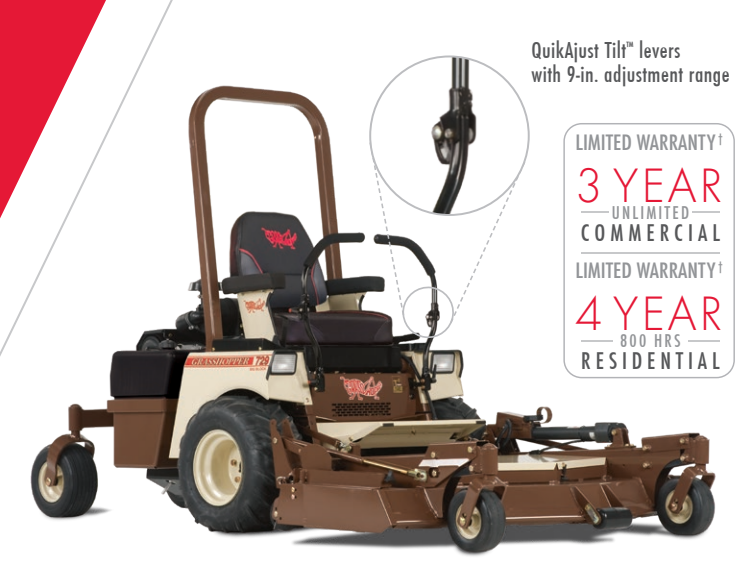
Standard PowerFold® Electric Deck Lift. See Page 13 for more info.