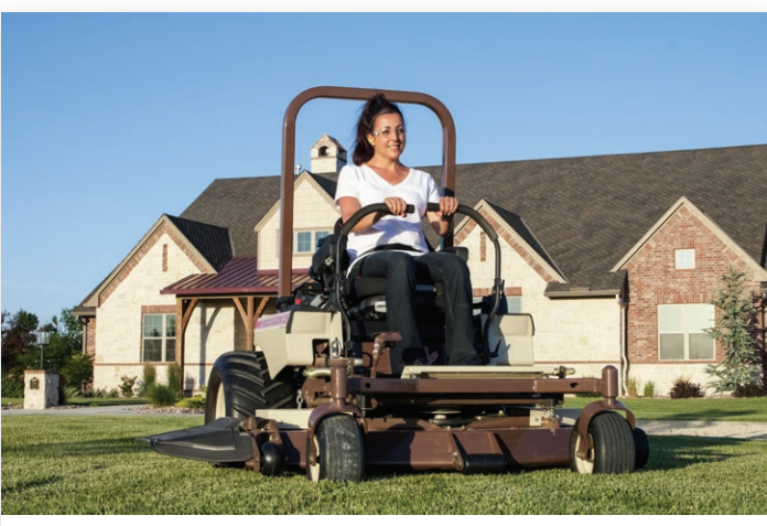
Featured Model 329B with 61-inch DuraMax® deck and optional bar tread tires