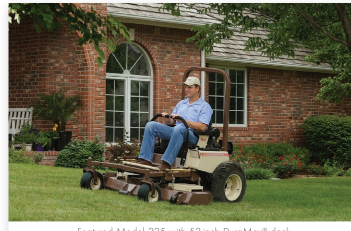
Featured Model 225 with 52-inch DuraMax® deck

48-in. – 25 lbs. (11.3 kg); 52-in. – 29 lbs. (13.2 kg); 61-in. – 36 lbs. (16.3 kg).