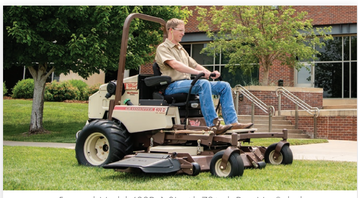
Featured Model 400D 1.3L with 72-inch DuraMax® deck