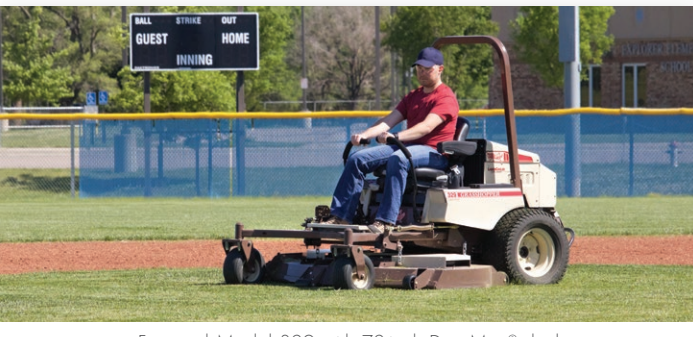
eatured Model 329 with 72-inch DuraMax® deck